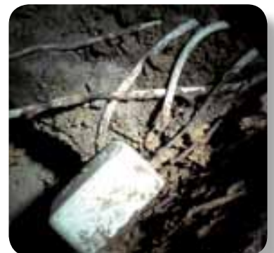
TERMITE DAMAGE TO ELECTRICAL CABLES