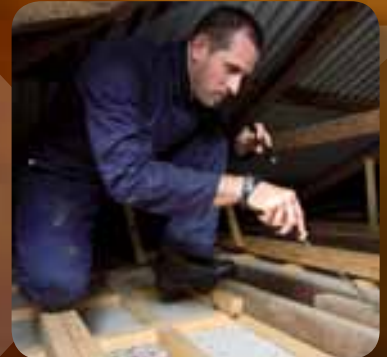
INSPECTING ROOF TIMBERS

When there is no known termite activity in your home.