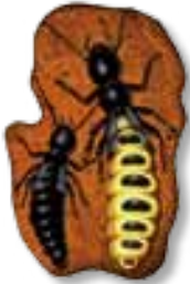
King and Queen

The Queen occupies a royal cell with the king. She may live up to 25 years, laying many thousands of eggs annually.