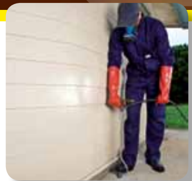
DRILLING AND INJECTING BARRIER

Step 3: Your Eflex Accredited Operator will recommend re-treatment and inspection periods based on construction, environment and location. It is a condition of the FMC Million Dollar Warranty that your Eflex Accredited Operator conducts a full inspection of your home at least once every twelve months.