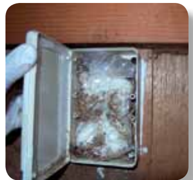
INSPECTION OF EXCEL STATION BY EFLX ACCREDITED OPERATOR