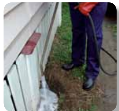
FLOODING AROUND STUMPS

take the worry out of subterranean termite protection with ... a little help from mother nature!