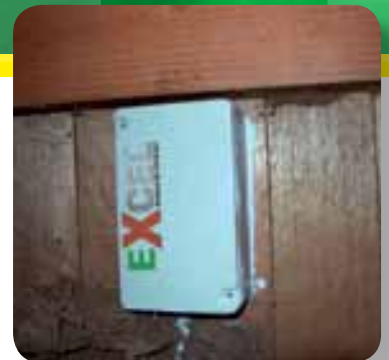
MOUNTED EXCEL ABOVE GROUND STATION AFFIXED TO TERMITE ACTIVITY

Biflex and Excel – the best of both worlds.