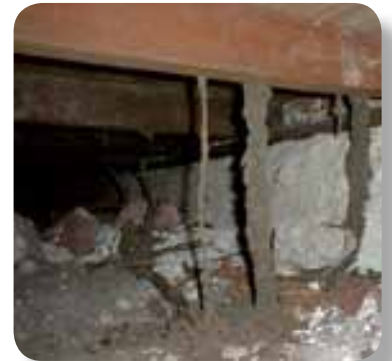
TERMITE ATTACK TO SUB-FLOOR AREA