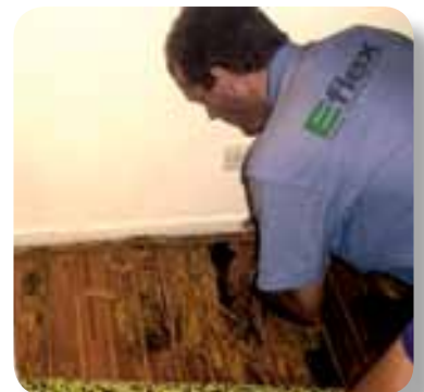
TERMITE DAMAGE TO FLOOR - CONCEALED BY CARPET