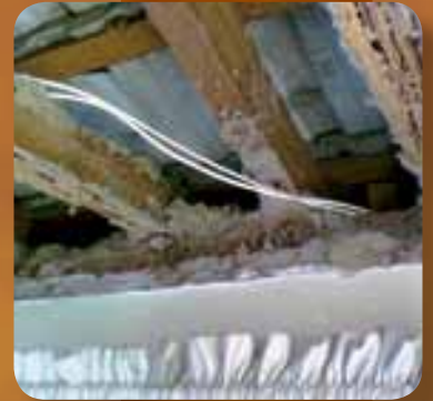
TERMITE ATTACK TO ROOF STRUCTURE (CEILING REMOVED) OF DOUBLE BRICK HOME

Unfortunately for our homes, they do not discriminate between dead or decaying timber and other cellulose-based building materials. Even electrical conduit is not exempt.