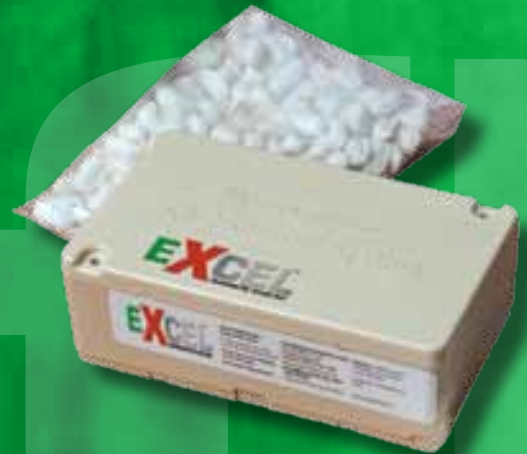
EXCEL TERMITE BAITING STATION COMPONENTS

When you have found termite activity in your home.